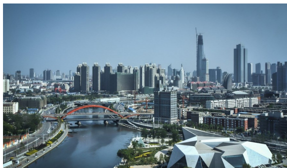
( Tianjin, China above)